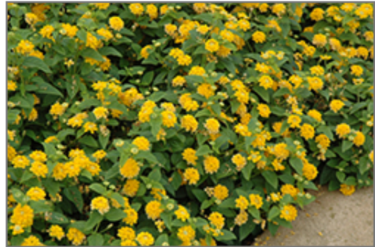
Little Lucky Pot Of Gold Lantana flowers