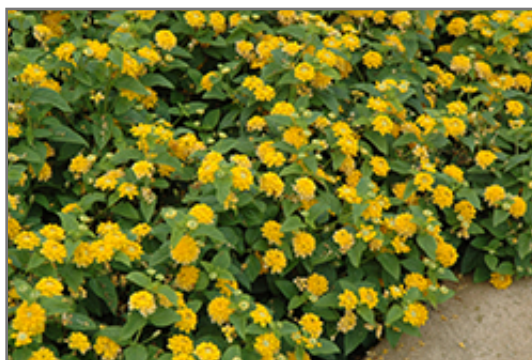
Little Lucky Pot Of Gold Lantana flowers