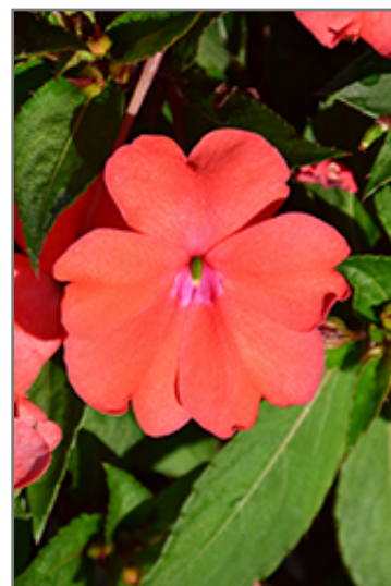
SunPatiens Spreading Corona New Guinea Impatiens flowers