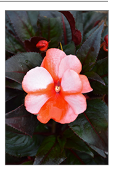
Sonic Sweet Orange New Guinea Impatiens flowers

This plant will require occasional maintenance and upkeep, and should not require much pruning, except when necessary, such as to remove dieback. It has no significant negative characteristics.