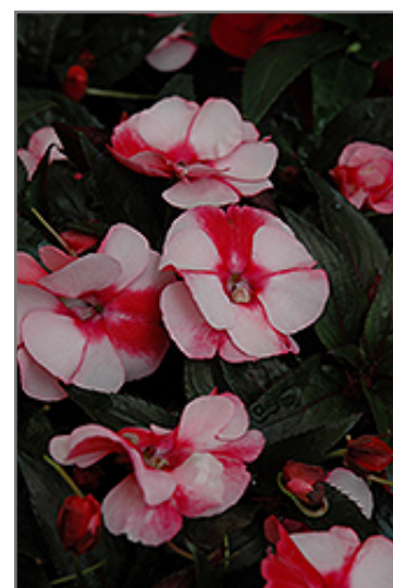
Sonic Sweet Cherry New Guinea Impatiens flowers