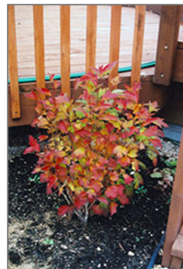
Compact Highbush Cranberry in fall