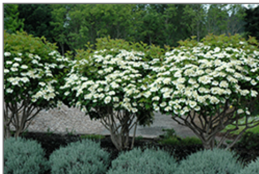
Compact European Cranberry in bloom