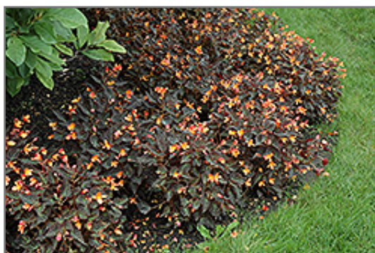
Sparks Will Fly Begonia in bloom