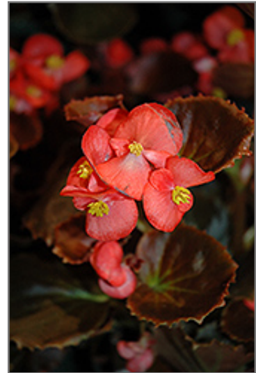
Nightife Red Begonia flowers