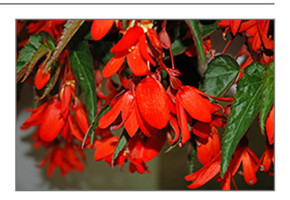
Waterfall Encanto Falls Begonia flowers

This variety features slender, pointed green leaves, complimenting a cascading display of scarlet red flowers; continuously blooming with no deadheading needed; great for containers and baskets