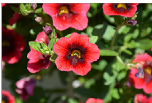
Superbells Pomegranate Punch Calibrachoa flowers