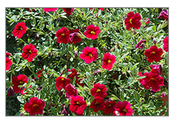
Celebration Extreme Red Calibrachoa flowers