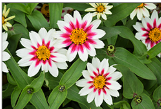
Zahara Starlight Rose Zinnia flowers

Zahara Starlight Rose Zinnia is recommended for the following landscape applications;