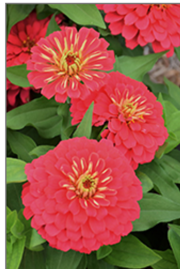
Magellan Coral Zinnia flowers