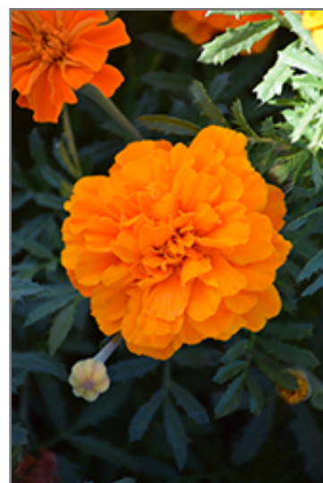
Safari Tangerine Marigold flowers