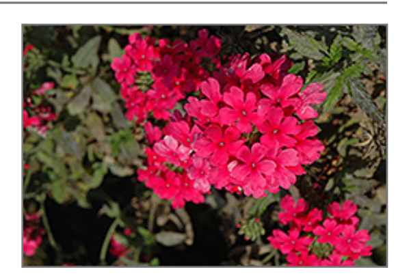
Empress Salmon Pink Verbena flowers