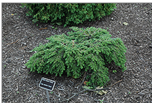
Gracilis Hemlock