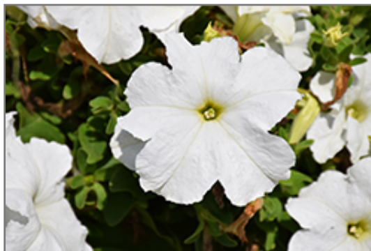
EZ Rider White Petunia flowers