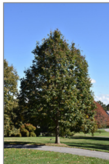
Redmond Linden