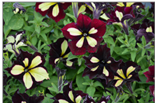
Crazytunia Star Jubilee Petunia flowers