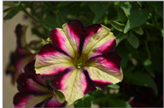
Crazytunia Pulse Petunia flowers

Crazytunia Pulse Petunia is recommended for the following landscape applications;