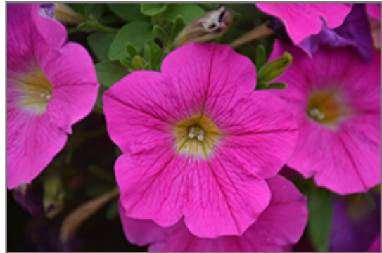
Sweetunia Hot Pink Lemonade Petunia flowers