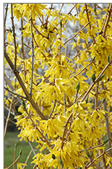
Northern Gold Forsythia flowers