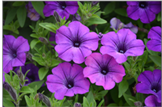
Supertunia Indigo Charm Petunia flowers