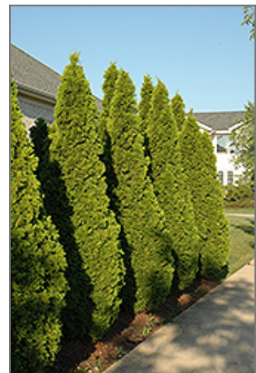
Emerald Green Arborvitae