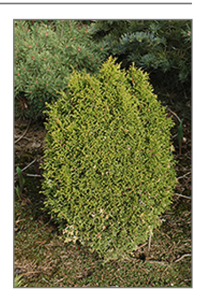
Boisbriand Arborvitae