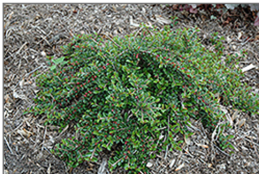
Little Gem Cotoneaster