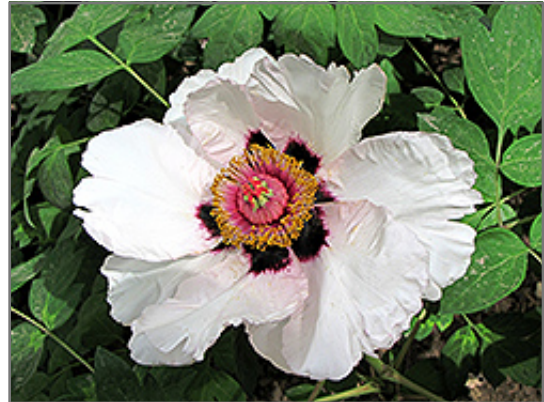
Tian Shi Tree Peony flowers

Lovely white flower petals with contrasting burgundy-black flares, and golden stamens surrounding a rose pink eye; great as an accent in the garden or massed in borders; unlike perennial peonies, remember not to prune this variety