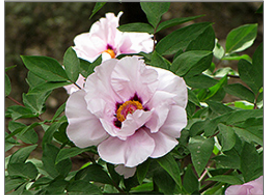
Dai Yu Tree Peony flowers