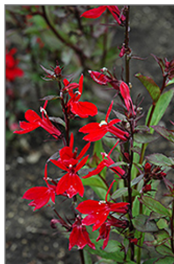
Fan Scarlet Cardinal Flower flowers