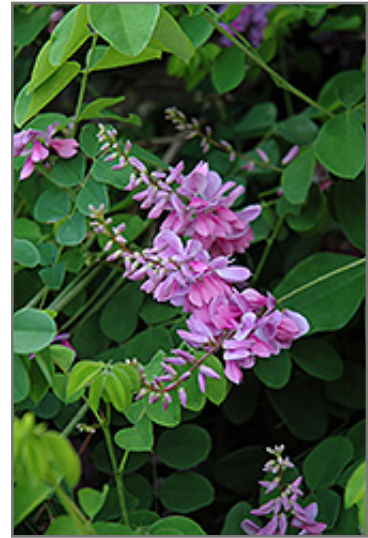
Chinese Indigo flowers