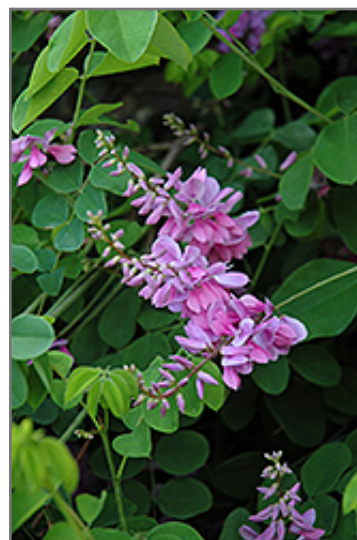
Chinese Indigo flowers