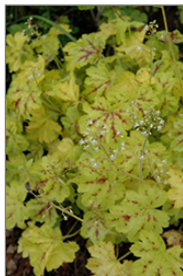
Solar Power Foamy Bells flowers