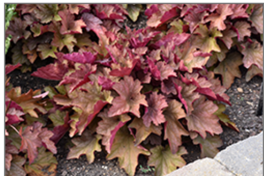
Carnival Watermelon Coral Bells