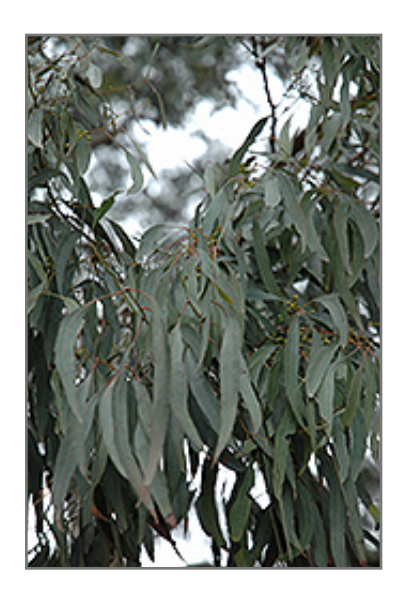
Tasmanian Blue Gum foliage