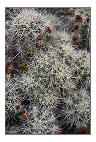
Mexican Claret Cup

Mexican Claret Cup is recommended for the following landscape applications;