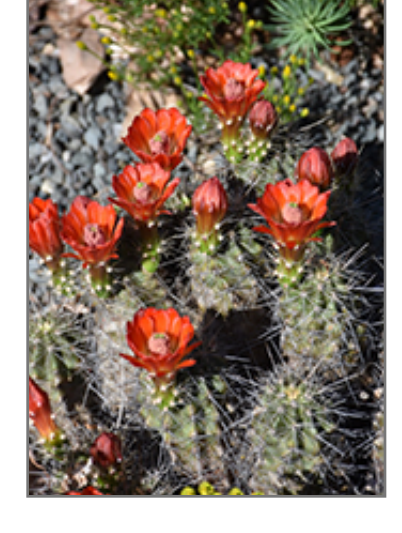
Mexican Claret Cup flowers