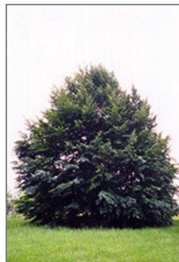
European Beech