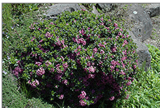
Wilhelm Schact Daphne in bloom