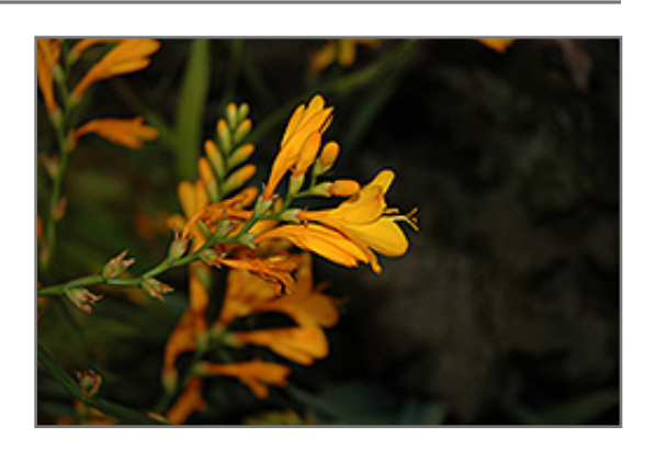
Columbus Crocosmia flowers