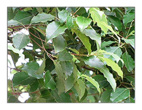
Camphor Tree foliage

Camphor Tree will grow to be about 60 feet tall at maturity, with a spread of 50 feet. It has a low canopy with a typical clearance of 3 feet from the ground, and should not be planted underneath power lines. It grows at a slow rate, and under ideal conditions can be expected to live to a ripe old age of 150 years or more; think of this as a heritage tree for future generations!