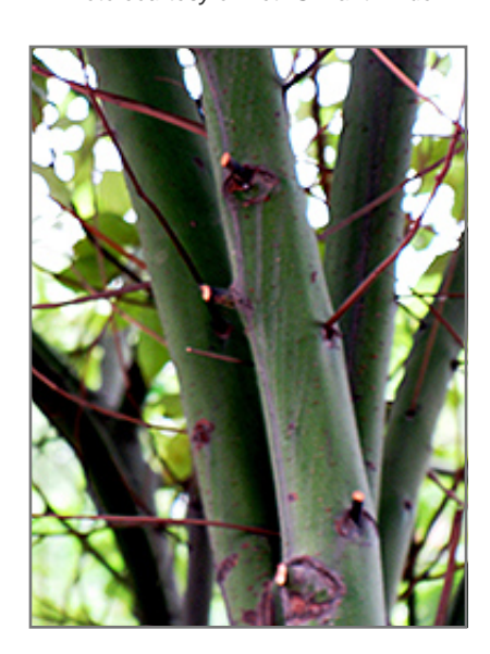
Camphor Tree bark