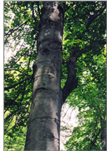
American Beech bark

This plant is not reliably hardy in our region, and certain restrictions may apply; contact the store for more information.