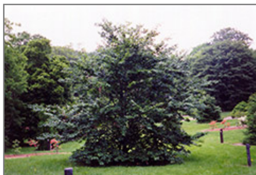
American Beech