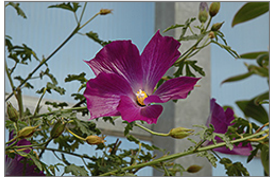
Leon's Purple Delight Lilac Hibiscus flowers