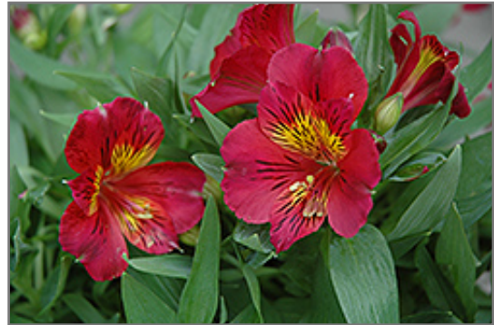
Oxana Princess Lilies Alstroemeria flowers