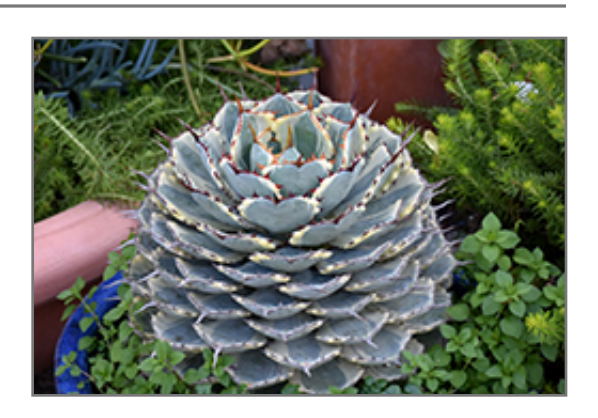
Kissho Kan Agave

Kissho Kan Agave is recommended for the following landscape applications;