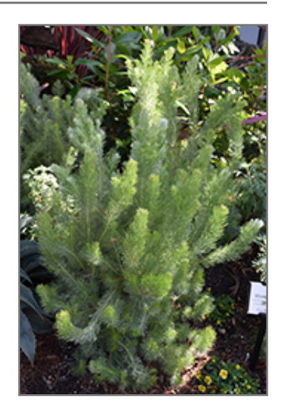
Coastal Wooly Bush

Coastal Wooly Bush is recommended for the following landscape applications;