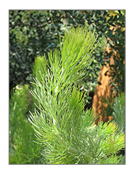
Coastal Wooly Bush foliage