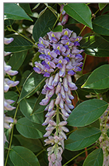
Summer Cascade Wisteria flowers

Summer Cascade Wisteria is recommended for the following landscape applications;