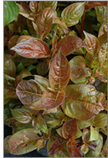
Wings Of Fire Weigela foliage