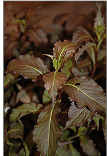
Spilled Wine Weigela foliage

This plant is not reliably hardy in our region, and certain restrictions may apply; contact the store for more information.