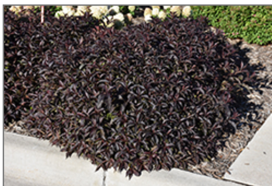
Spilled Wine Weigela