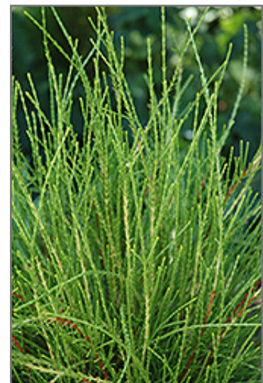
Franky Boy Arborvitae foliage