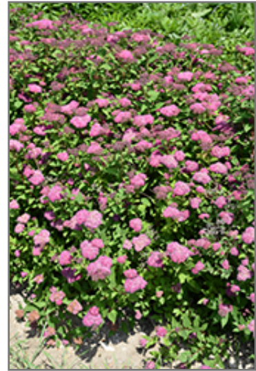
Double Play Artisan Spirea in bloom

This plant is not reliably hardy in our region, and certain restrictions may apply; contact the store for more information.