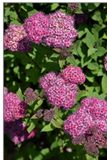
Double Play Artisan Spirea flowers

Double Play Artisan Spirea is recommended for the following landscape applications;