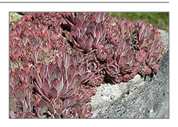
Purdy's Big Red Hens And Chicks