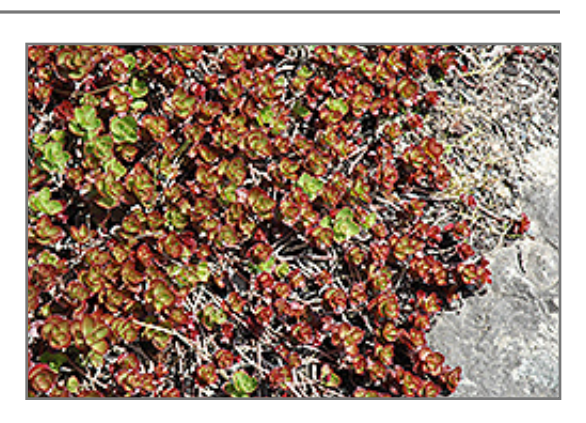
Two Row Stonecrop